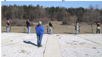
March Youth Trap Shoot