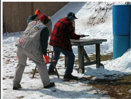
IDPA in Wintertime!

IDPA matches are on the 4th Saturday of the month. New shooters (including CPL holders) are welcome to attend. Please register on the web site, and show up to the match 30 minutes before your start time. You may choose from the following start times: 10am (SO's only), 12 noon, and 2:30pm. Food (burgers, brats) and soft drinks will be available. Cost to shoot the match is $20, and if you wish to shoot again, it is $10. Plan on bringing 150 rounds of ammunition.